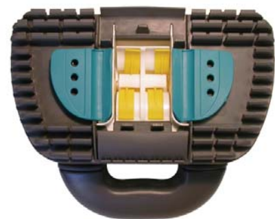
Rows of squeegee-like fins scrub and dislodge stubborn dirt so it can be vacuumed away.